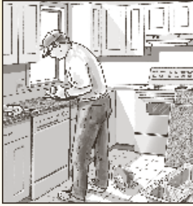
Time to replace your kitchen countertop? Many materials available now are durable, non-toxic, resource-efficient and great-looking, too.

Believe it or not, Richlite countertop material is made from cellulose fiber (paper) and resin. The chief environmental benefit of Richlite is that it is made from a renewable resource instead of leaving a "permanent hole in the ground" like granite and marble do. For more information visit www.richlite.com .