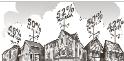
Disappointing News about '05

By participating in this new program, Lamorinda residents will ensure that leftover food scraps are transformed into a nutrient-rich soil amendment used by landscaping companies around the Bay Area.