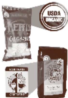
Fair Trade Certified and USDA Organic are just two of the many new labels that help identify green products. Visit www.eco-labels.org for tips on how to interpret all the options.

To give the site a try yourself, go to www.eco-labels.org . Another good source of information about making choices in the marketplace is the Consumer's Guide To Effective Environmental Choices , available at your local bookstore or online.